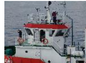
On patrol north of One Fathom Bank