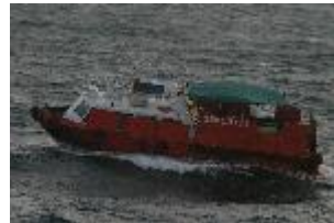
On patrol north of Sumatra