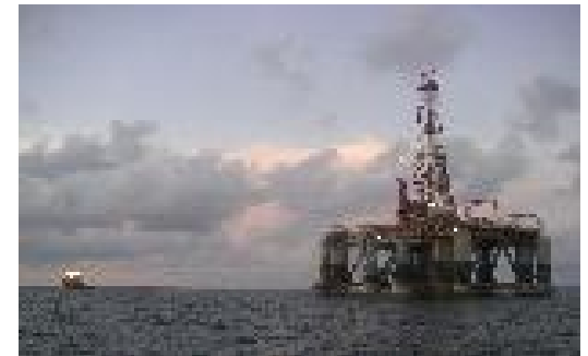
Escorting a semi sub