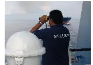
Watch duty South East Asia