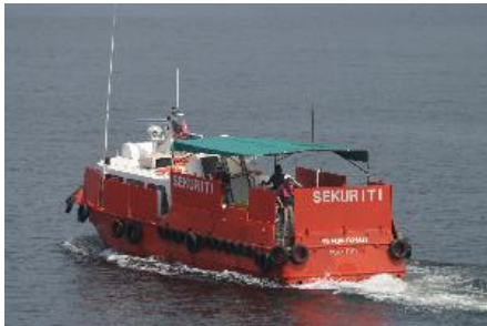
Quick Response Escort Vessel